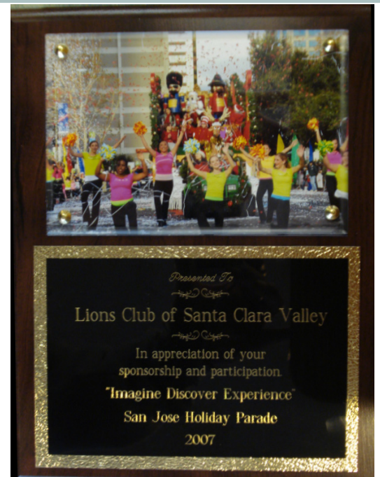
Lions Club of Santa Clara Valley was the only recipient of the San Jose Holiday Parade plaque from the Major of San Jose.

Please submit your picture(s) to newsletter@almadenlions.org before the 5th of each month for that month's newsletter.