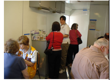
While people lined up outside of the trailer, every station was busy inside.