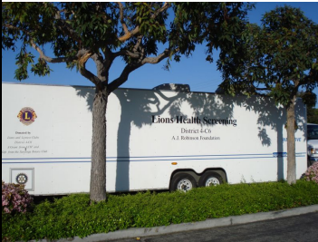
A J Robinson Mobile Health Screening Trailer parked at the Princeton Plaza Farmer Market. Logos of Lions and A J Robinson Foundation were clearly visible.

It was my first time participating in the A J Robinson Mobile Health Screening this morning (April 13). What an experience that made me so proud to be a Lion. We were at the Princeton Plaza Farmer's Market. I do not know how many people were screened but we were busy. There were people waiting in line outside of the trailer and every station inside had clients. We helped people who did not know their glucose level or blood pressure were high. When my shift was over three hours later, I was a happy person - I might have saved someone's life today! It was such a wonderful and fulfilling experience! If you have never done it before, you should try it, too.