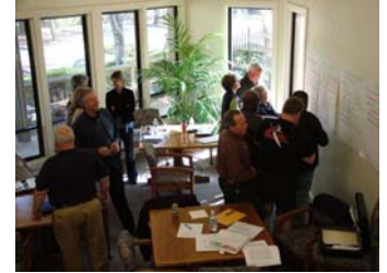
Club members actively participated in a workshop discussing ways to keep the "magic".