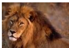
Lion waiting for left-overs.